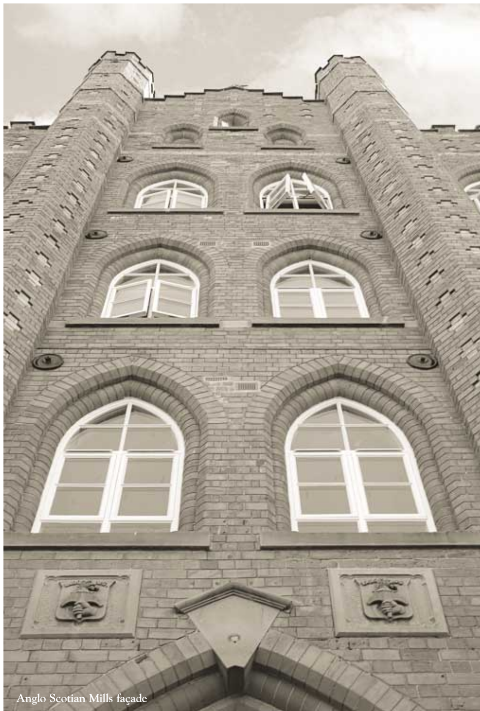
Anglo-Scottish Mills facade