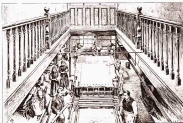
THE PRINTING DEPARTMENT.