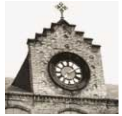
Anglo Scotian Mills clock

One of Pollard's first tenants at Anglo Scotian Mills was Parkes & Tomlin, a small firm originally with just four curtain machines whose business grew steadily until they eventually occupied the whole of the Wollaton Road building. Parkes purchased the building in 1922 and today the building is still known to some as "Parkes Factory". Lace and hosiery manufacture continued until the 1960s when the building was bought by Ariel Pressings for the manufacture of electrical components. Ariel Pressings were amalgamated within the multinational company, The Stadium Group who continued to operate from the site until manufacture was moved to the Far East in 2003.