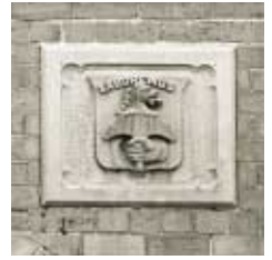
'We work' plaque

Behind the façade, the warehouse and factory were very simply built, just red brick and slate roof, spanned by heavy timber beams with pillar supports at their centres. The tall windows were no doubt intended to admit maximum light to work on the lace. Brother George complemented Frank's enterprise by building rows of houses for workers, and also (we surmise) the Commercial Inn for the commercial travellers who came to buy lace. Together their enterprise transformed Beeston in the 1880s and 1890s.