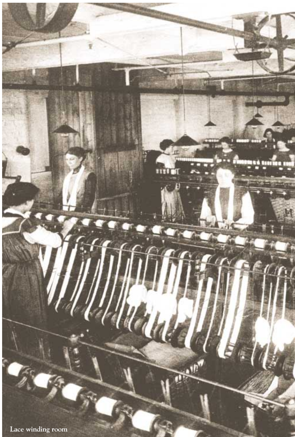
Lace winding room